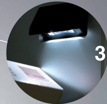
3. Barcode Scanning