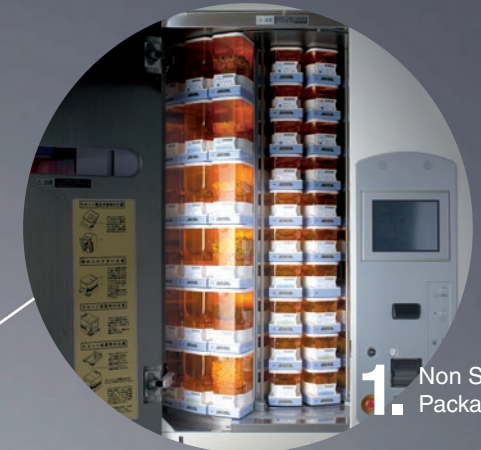
1. Non Stop Packaging