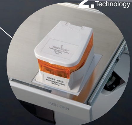
2. 100% RFID Chip Technology